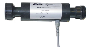
1" Biox Electrochemical probe.

Sensors group: Biox electrochemical probes Temperature sensor Water flow sensor